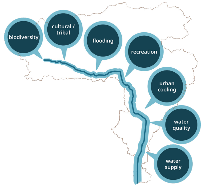
Management themes for the LA river and watershed

We recognize your life work and dedication to the evolving story of LA River and its watershed over the years. We need your voice and wealth of knowledge to move through the process of identifying management goals, structured decision-making, alternatives development, assessing tradeoffs and solutions that may achieve multiple goals for the river. As a TWG participant, you will guide decision making around the resulting environmental flow recommendations.