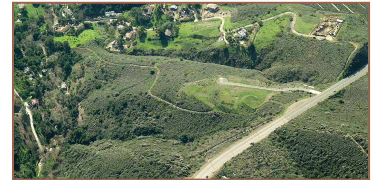
Ramirez Canyon Coastal Slope Trailhead, Santa Monica Mountains