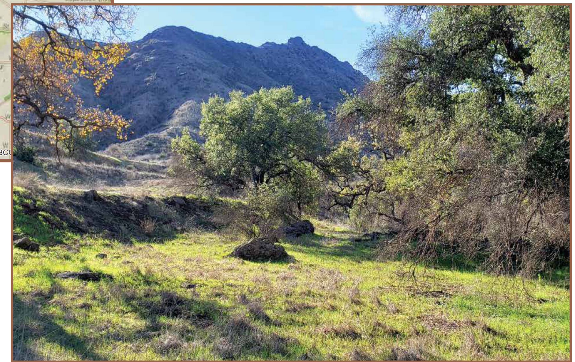
Triangle Ranch, Agoura Hills