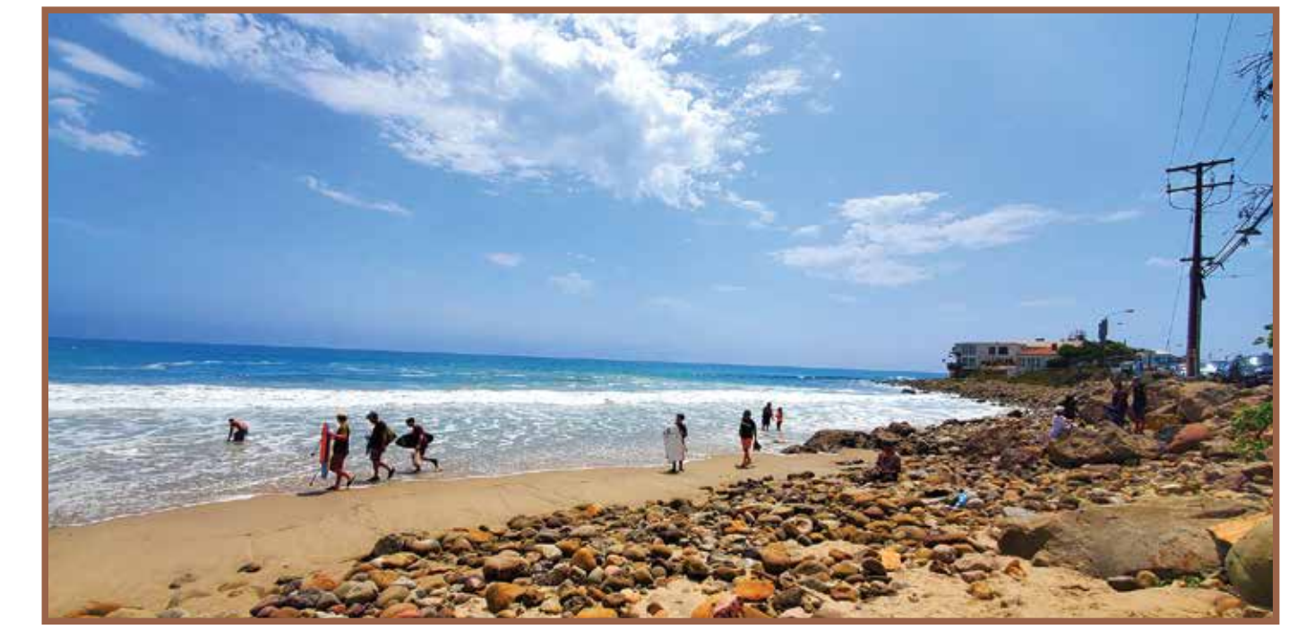
Carbon-La Costa Beach, Malibu