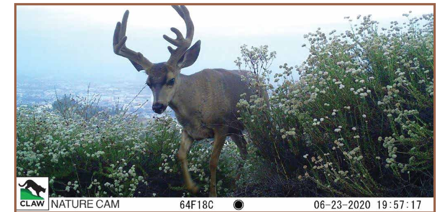
Lookout Mountain, Hollywood Hills