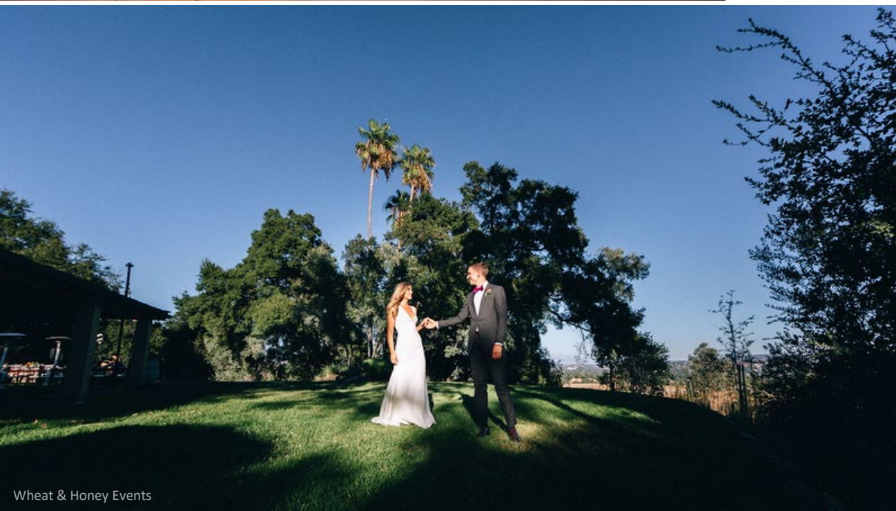
Wheat & Honey Events