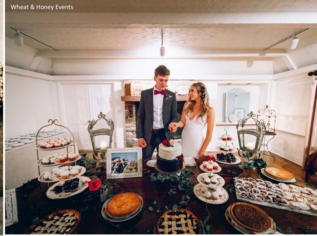
Wheat & Honey Events