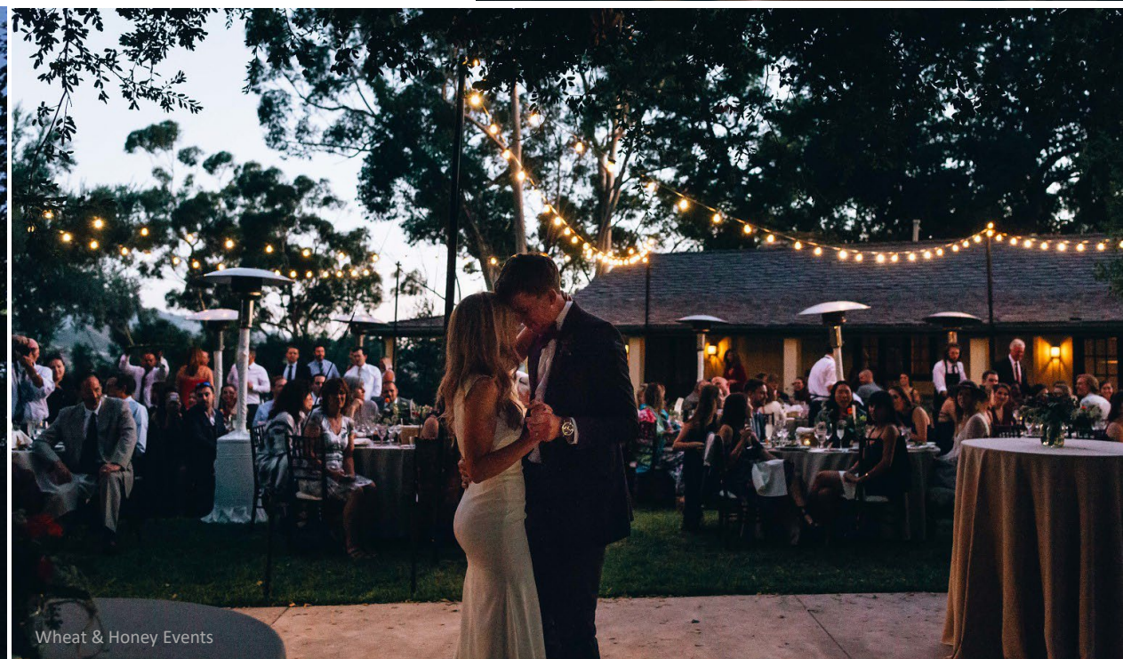
Wheat & Honey Events