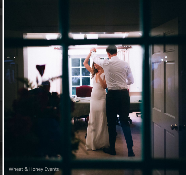
Wheat & Honey Events