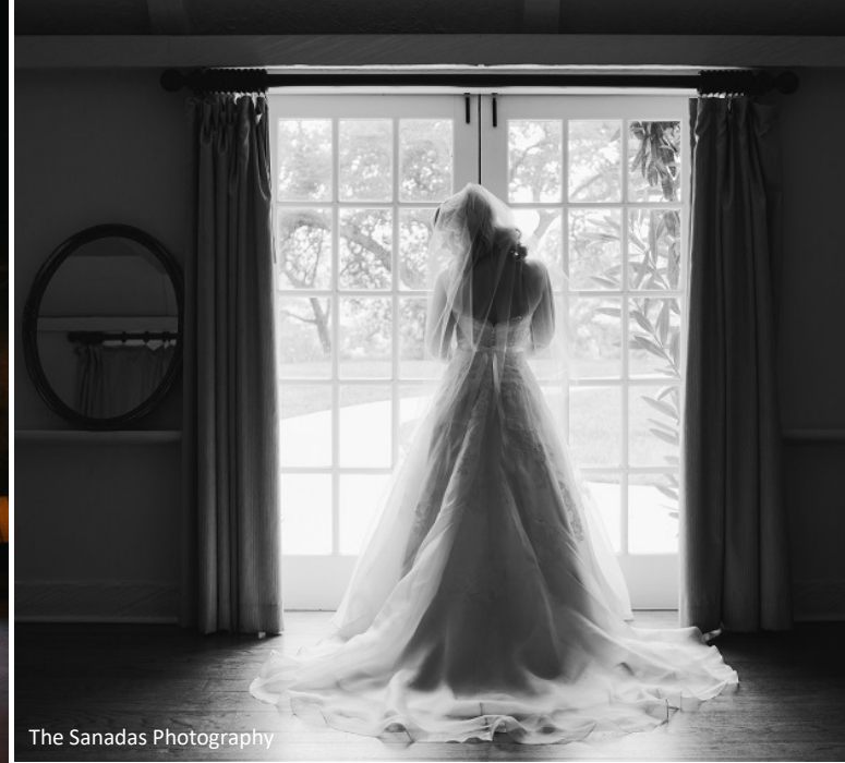
The Sanadas Photography