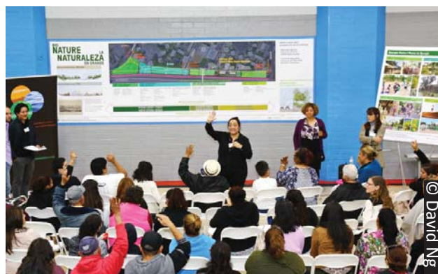
Legacy LA led outreach to identify community priorities.