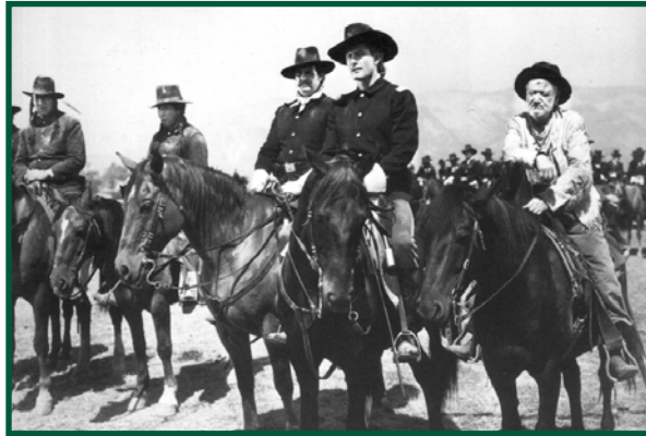
They Died With Their Boots On