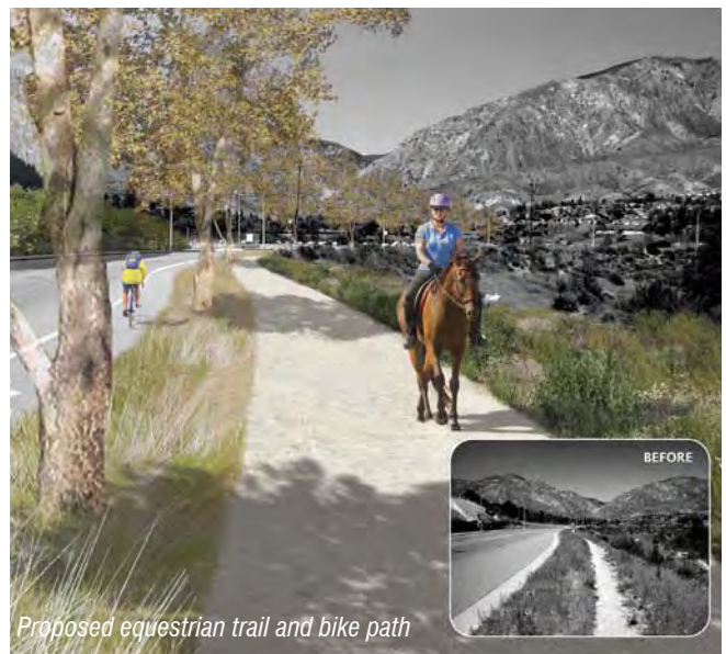
Proposed equestrian trail and bike path