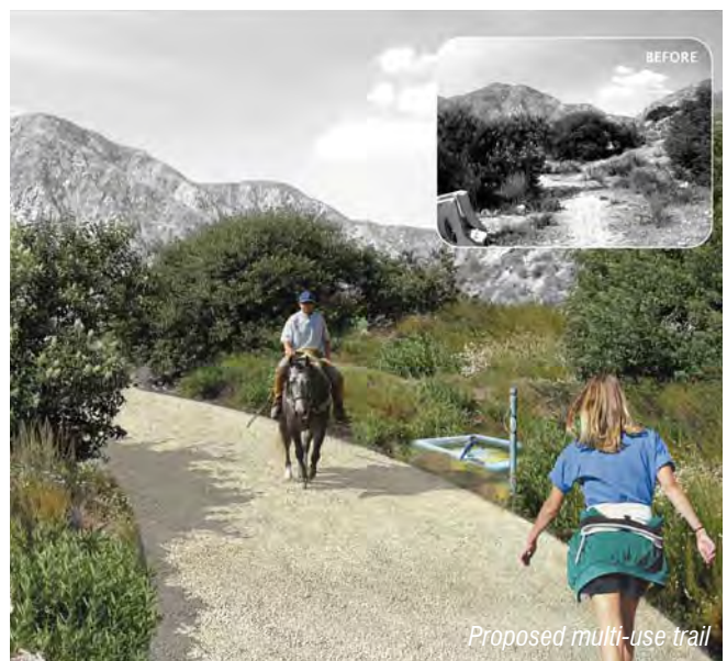
Proposed multi-use trail