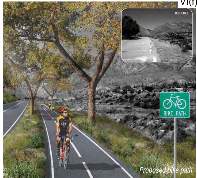
Proposed bike path

The vision plan takes a systematic, holistic approach to the Pacoima Wash corridor by incorporating and considering movements that occur adjacent to the Wash and throughout the study area. The plan recognizes that a multi-benefit planning and design approach can achieve a variety of goals, including improvements in public health, recreation, wildlife habitat, water quality, transportation, and community building. This approach creates a cohesive vision that identifies, preserves, and enhances the area's unique character.